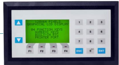
Prizm Operator Panel Example: Prizm140 - By Renu Electronics