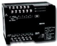
PLC (Modbus Master)