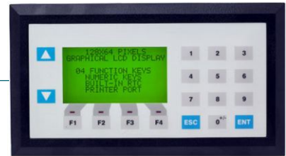
Prizm Operator Panel Example: Prizm140 - By Renu Electronics