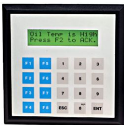
Prizm Operator Interfaces Example: Prizm15-By Renu Electronics