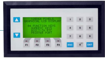
Prizm Operator Panel Example: Prizm140 - By Renu Electronics