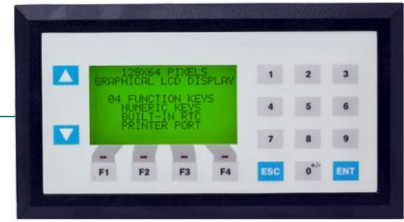
Prizm Operator Panel Example: Prizm140 - By Renu Electronics