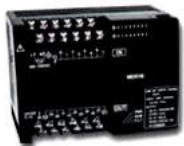
PLC (Modbus Master)