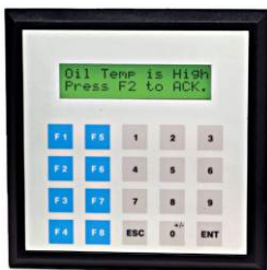
Prizm Operator Interfaces Example: Prizm15-By Renu Electronics